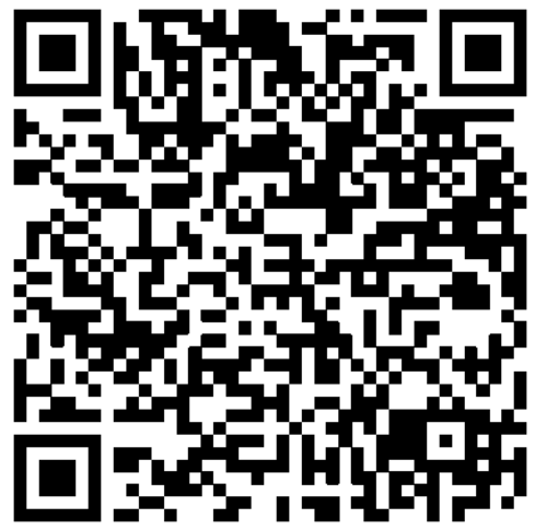
IIDT YouTube Playlist