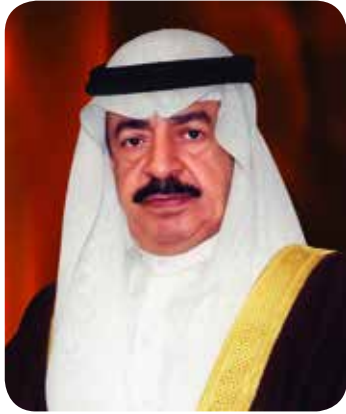
His Royal Highness Prince Khalifa Bin Salman Al Khalifa The Prime Minister