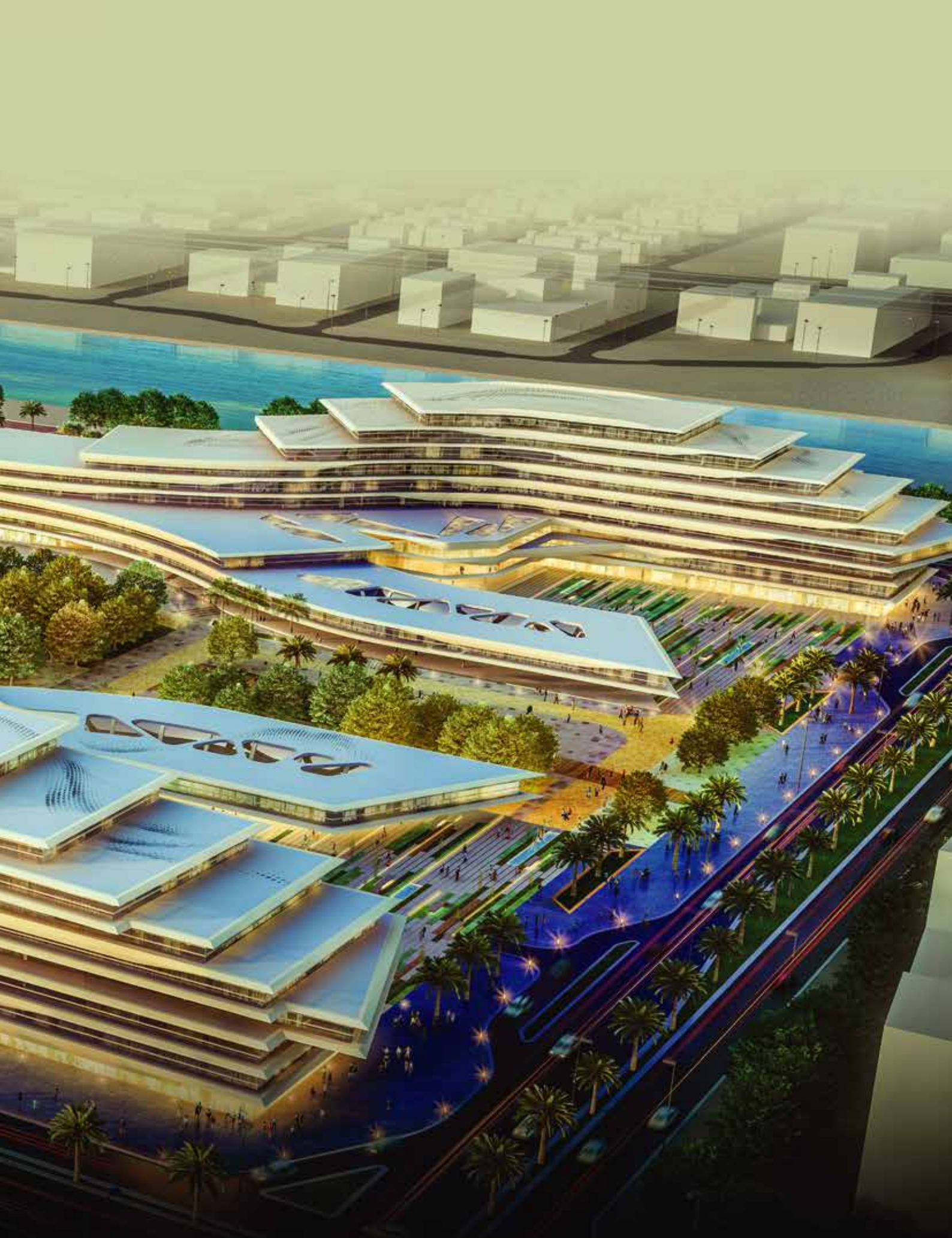
Artist's impression of the new Ahlia University campus at Al Madina Al Shamaliya.