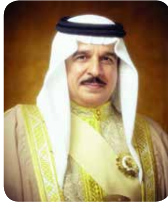
His Majesty King Hamad Bin Isa Al Khalifa The King of the Kingdom of Bahrain