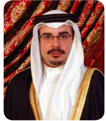
His Royal Highness Prince Salman Bin Hamad Al Khalifa The Crown Prince, Deputy Supreme Commander and First Deputy Prime Minister