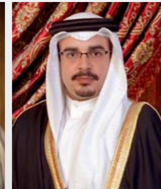
His Royal Highness Prince Salman Bin Hamad Al Khalifa Crown Prince Deputy Supreme Commander and First Deputy Prime Minister