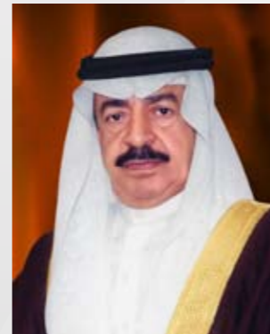
His Royal Highness Prince Khalifa Bin Salman Al Khalifa Prime Minister