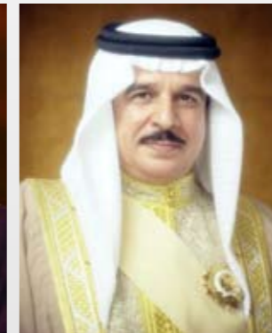
His Majesty King Hamad Bin Isa Al Khalifa King of the Kingdom of Bahrain