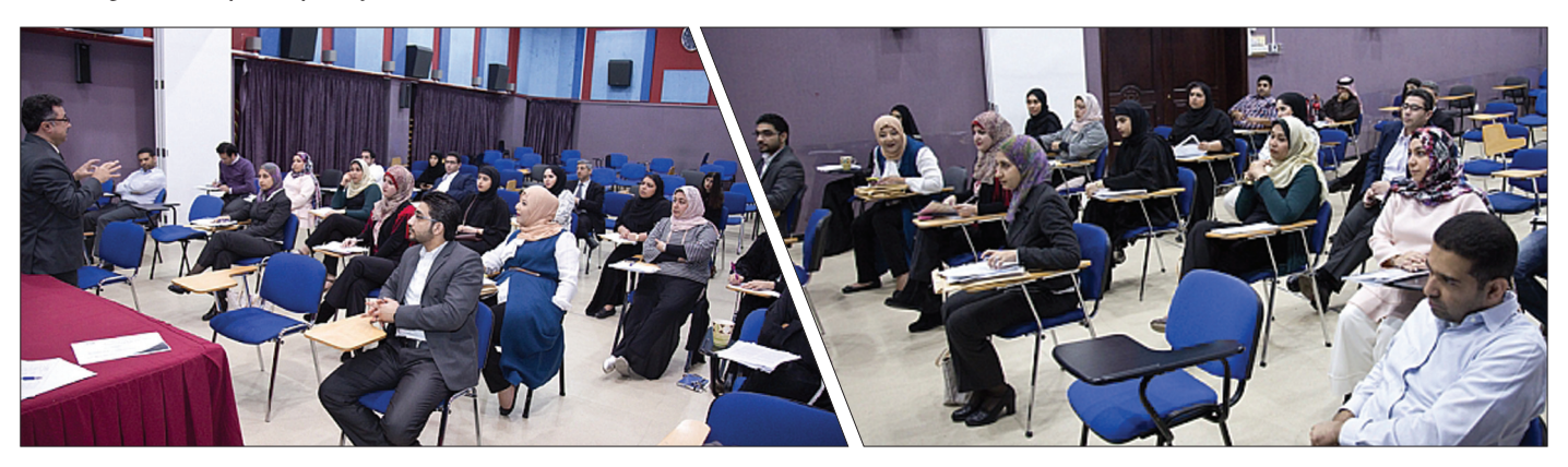
Faculty & students attend statistics for scientific research