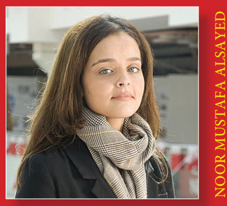
ACTING DIRECTOR – CENTRE FOR MEASUREMENT AND EVALUATION