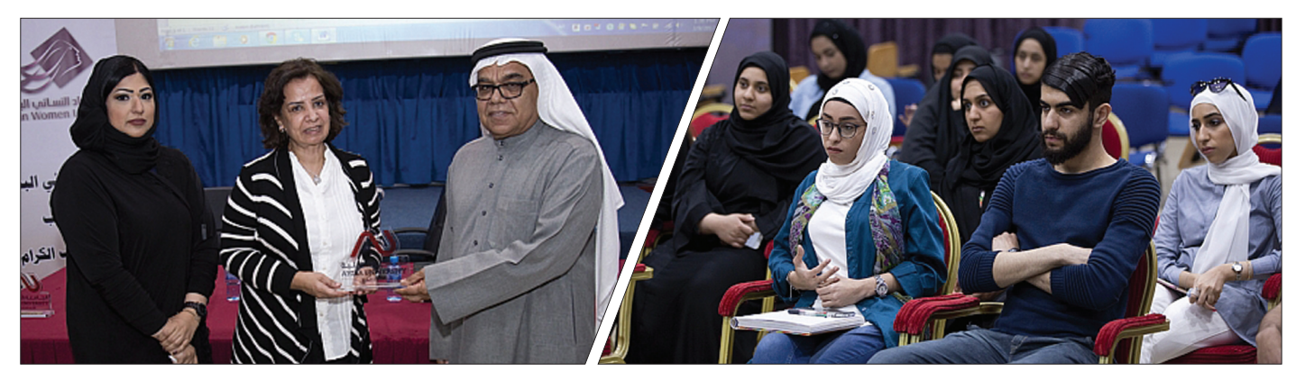
An educational lecture by the Bahrain Women's Association