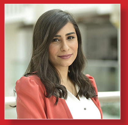
HEAD OF EMPLOYEE RELATIONS