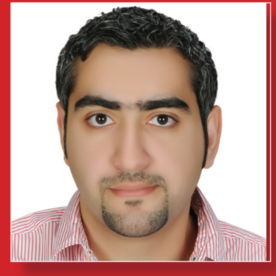
HEAD OF PURCHASING