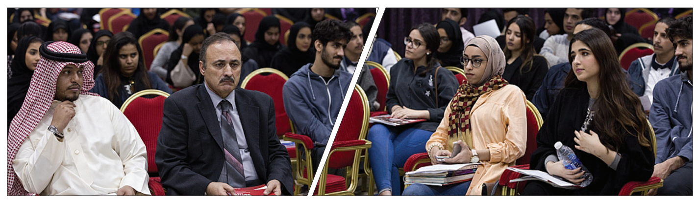
Training workshops to qualify students for the labour market