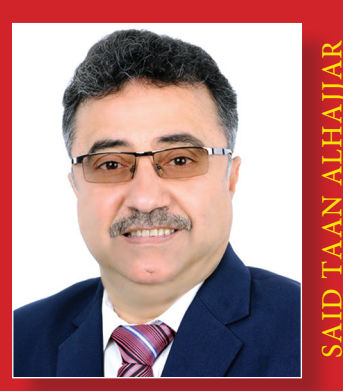
DIRECTOR OF CENTRE OF STATISTICAL ANALYSIS