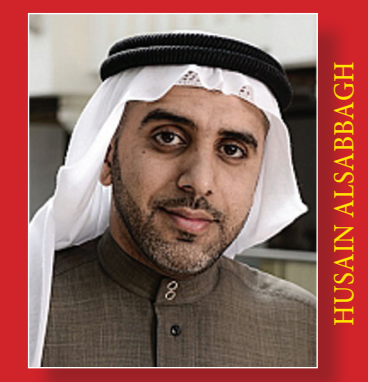
HEAD OF PRESS & PUBLISHING