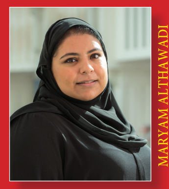
STUDENT PROJECTS FOLLOW UP OFFICER