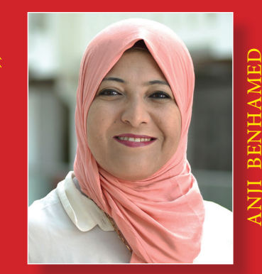
DIRECTOR OF AHLIA CENTRE FOR ENTREPRENEURSHIP