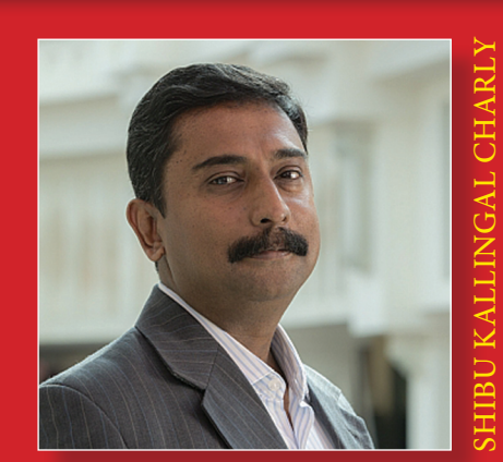
ACTING DIRECTOR - INFORMATION & COMMUNICATIONS TECHNOLOGY CENTRE